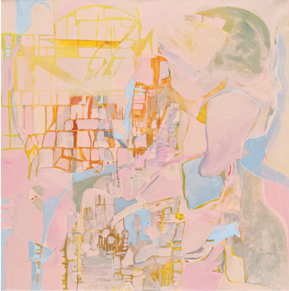
SECOND PLACE Teri Banas Through Pink Clouds Acrylic