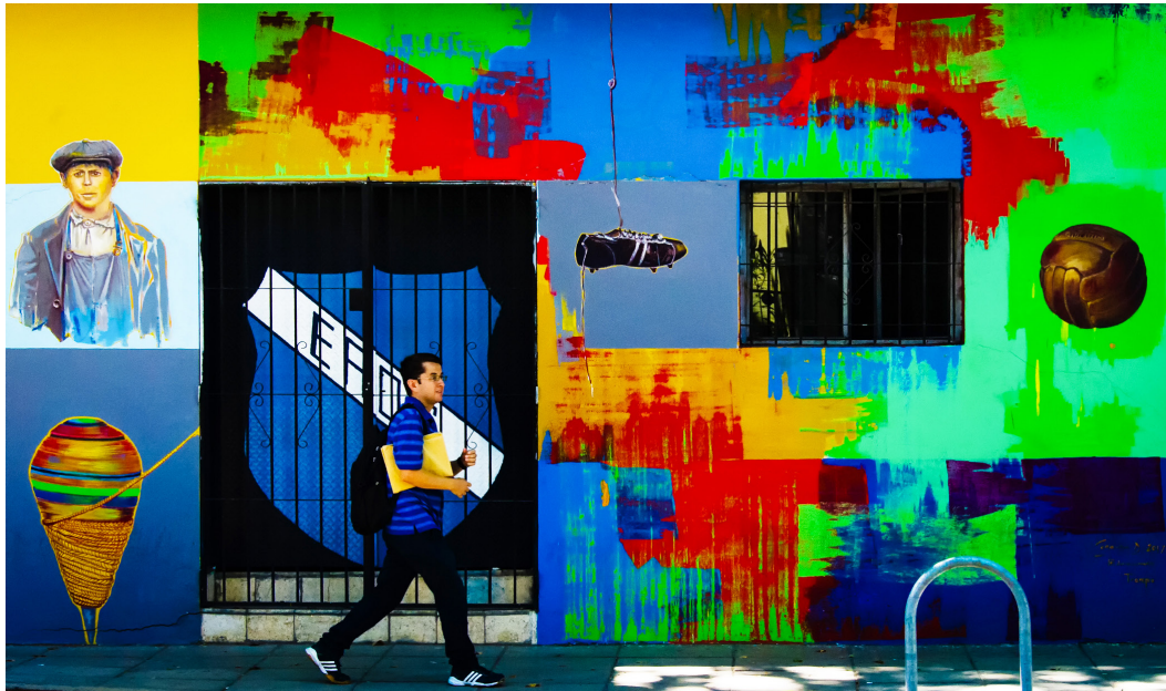
HONORABLE MENTION Paul M. Murray A Daily Walk Through a Dream Color Photography